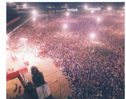
A Crusade Our Staff Helped to Organize