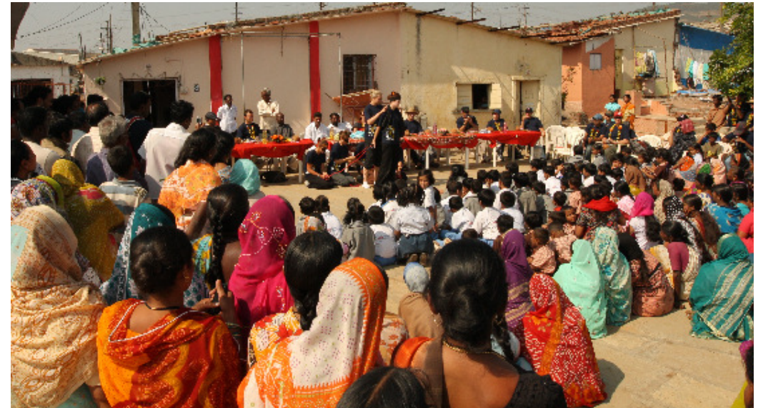
Ywam Staff Speaking to Unreahed, Pune, India