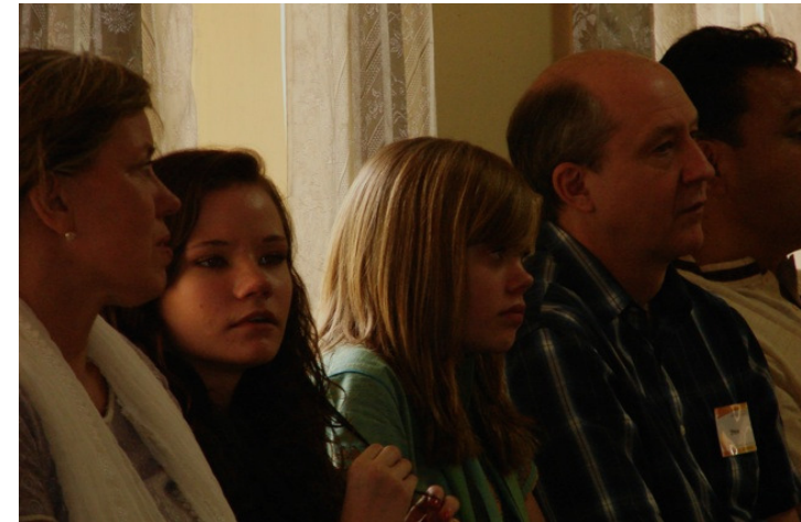
Sitting in Bangladesh Staff Conference