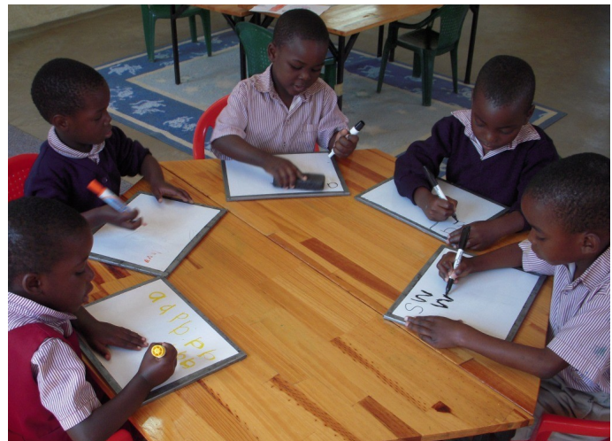
First Writing Lessons