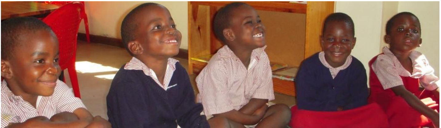
Ready for Class