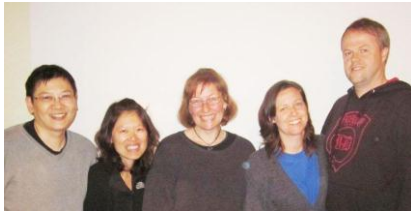
JCS team in Erdenet from Taiwan, USA, Germany and Sweden