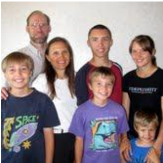
Mills from USA: Big families can be missionaries too!