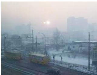
World Health says Ulaanbaatar has the 2 nd worst air pollution in the world