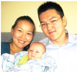
Our tutors’ 3-week old baby named “ Shining Star ” +++

“ Have you recruited anyone to take your place in Mongolia,” our Covenant supervisors asked us? Liz & I first visited Mongolia in 2000, but we didn’t move here until 2008. Based on our experience, if someone is going to replace us in 2017 when we plan to return to the USA, they should come to visit next year . Will YOU come to Mongolia (for the first time)?